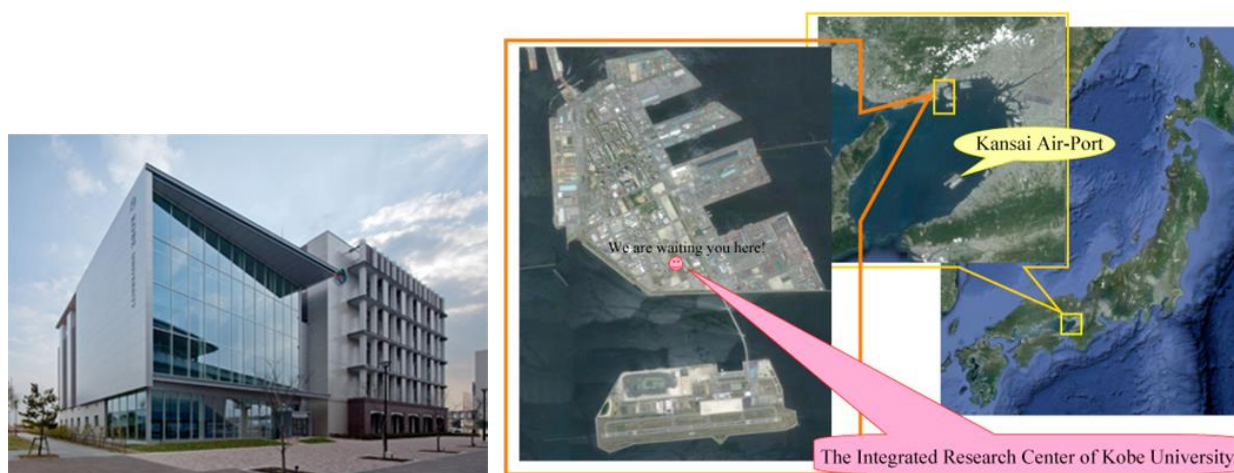
Integrated Research Center of Kobe University

The Hall of Integrated Research Center of Kobe University will be utilized as the main conference site located in Port Island, which is an artificial island in Kobe city. This faces to “K Computer Mae Station” of Port Liner, which are served between Kobe Airport and Sannomiya,